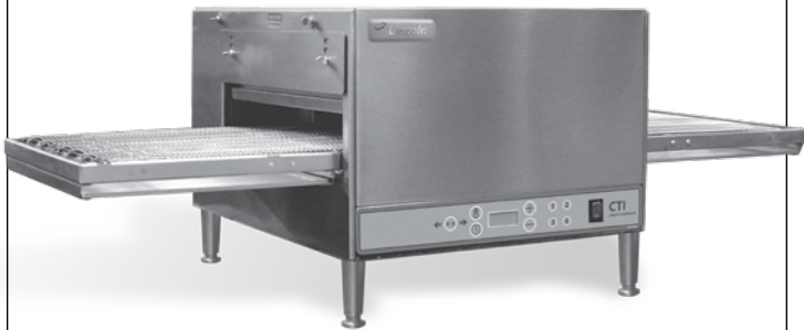
Shown with 50" (1270 mm) extended conveyor.