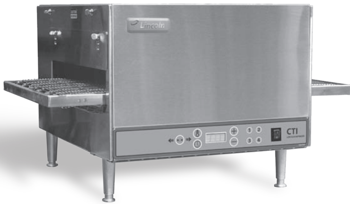
Shown with 31" (787 mm) standard conveyor.