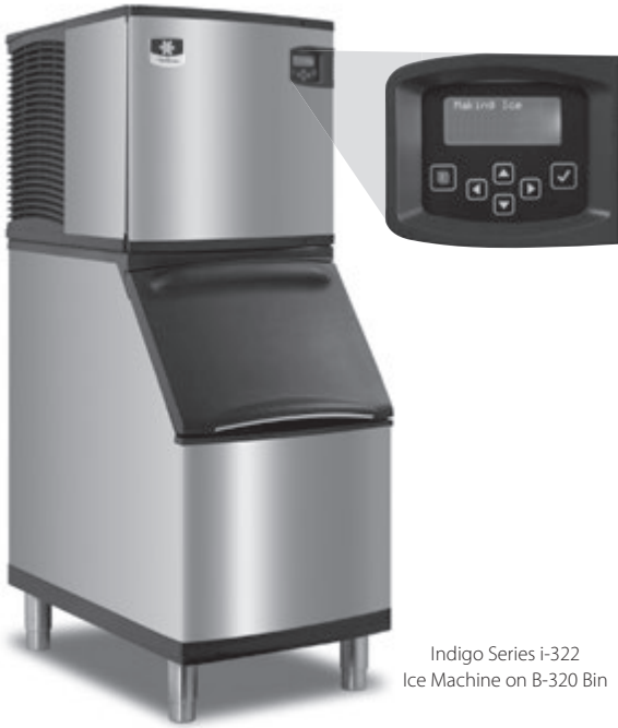
Indigo Series i-322 Ice Machine on B-320 Bin

Designed for operators who know that ice is critical to their business, the Indigo™ Series ice machine's preventative diagnostics continually monitor itself for reliable ice production. Improvements in cleanability and programmability make your ice machine easy to own and less expensive to operate.