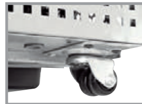
1 1/2" diameter dual swivel castors for "LP" models.