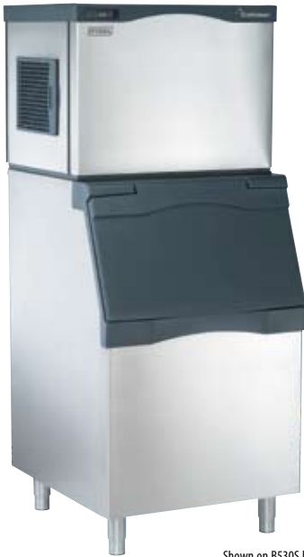
Shown on B530S bin.