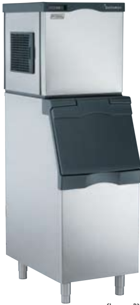
Shown on B322S bin.