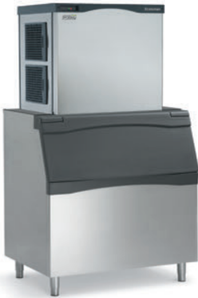
Shown on B948S bin with optional KLP8S legs.